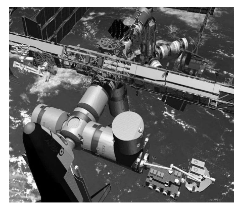
Figure 1. ISS with the SSRMS

Designing software that teaches requires, in advanced cases, the implementation of "intelligence" capabilities. After all, the best human teachers are those mastering the subject they teach, having communication skills and understanding the student's problem solving process in order to help him. With the aim of furthering intelligent software-based education systems, we have been developing a software simulator, called RomanTutor , that can be used to train astronauts to operate a robotic manipulation system (the Mobile Servicing System, MSS), on the International Space Station (ISS, Figure 1).