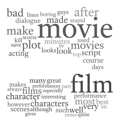
Figure 2: Fold all movie / film topics.

The first rule pulls uninteresting procedural words (e.g., "Mr. Chairman, I want to thank the gentlewoman for yielding...") into their own Topic 0. The other rules aim to discover interesting political topics associated with Rep on taxes and Dem on workers . As intended, Topic 0 pulls in other procedural words ({gentleman, thank, colleague}), improving the quality of the other topics. The special Rep taxes topics uncover