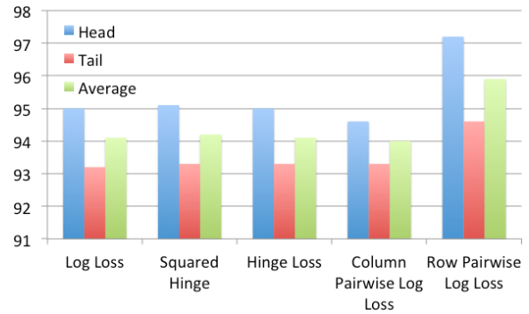
Figure 3: The Hits@10 scores of different loss functions for learning embeddings to retrieve head and tail entities on the WordNet dataset.

In this experiment, we vary the latent dimension k for learning first-order logic embeddings. The results are shown in Figure 2. We see that the latent dimension has an effect on the performance of the WordNet dataset. When choosing a