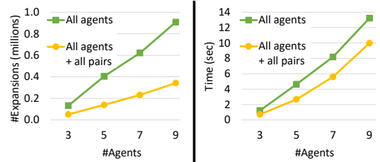
Figure 3: MKSP results for h_3 on the Enigma grid.

CPU time averaged over 50 instances for h_3 on the Enigma grid with 3 to 9 agents. As expected, adding all pairs of agents produces a better heuristic and fewer expansions. It was also better in terms of the CPU time despite the fact that its computation overhead is larger. Therefore, we used this subset selection policy for computing MKSP. It is future work to investigate different policies for choosing subsets.