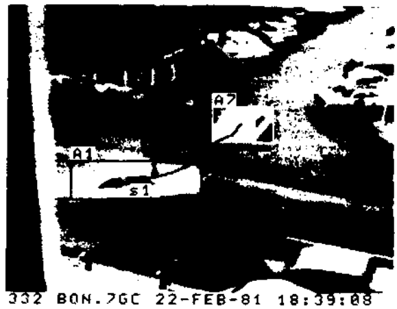
Fig. 2 Image sequence of moving car