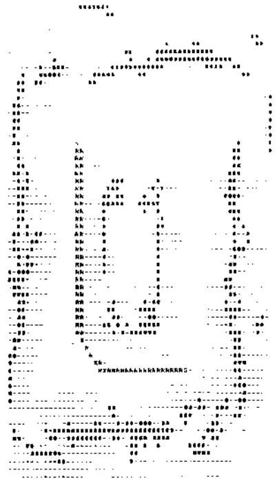
Figure 2 - Path through real data.

ed neighbours are tested. The value for each point in SPREAD is updated with a new path distance back to the start point if it is 1) free point, and 2) it is previously unvisited and 3) the new distance is smaller than its current estimate. Each of the