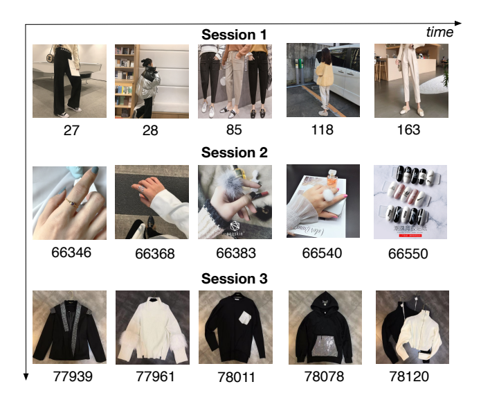
Figure 1: Here is one demo of sessions collected from a real-world industrial application. The number beneath the picture indicates the time gap, specified in seconds, between the time of clicking on the current item and that of clicking on the first item. Sessions are divided in the principle of whenever there exists a time gap of more than 30 minutes.

Recommender systems (RS) are becoming increasingly indispensable in assisting users to find their preferred items in web-scale applications such as Amazon and Taobao. Typically, an industrial recommender system consists of two stages: candidate generation and candidate ranking [Covington et al., 2016]. The candidate generation stage adopts some naive but time-efficient recommendation algorithms (e.g. item-based collaborative filtering [Sarwar et al., 2001]) to provide a relative small set of items from the huge whole item set for ranking. In the candidate ranking stage, complex but powerful models (e.g. neural network methods) are applied to rank the candidates so as to select the top-k items for recommendation. In this paper, we mainly focus on the candidate ranking stage and treat it as a Click-Through Rate (CTR) prediction task. It means we assume a relative small item set