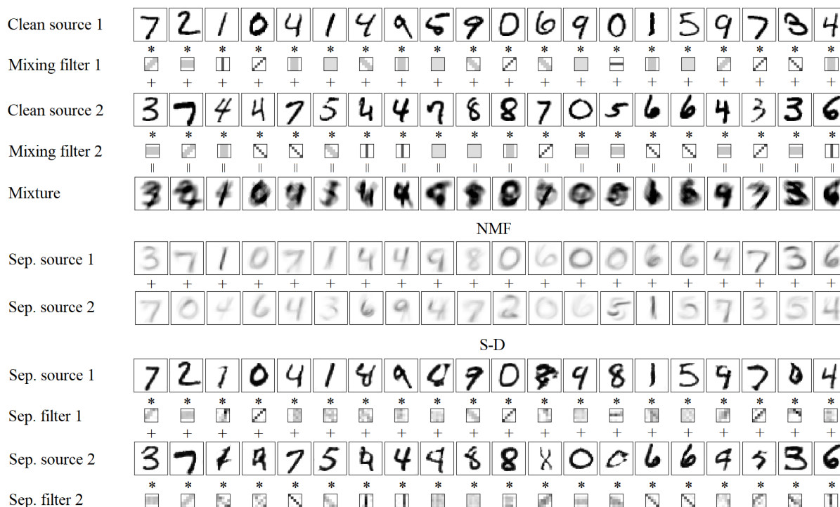
Figure 2: Image separation and deconvolution with NMF and S-D approach.

ing filters. The first column of Table 3 shows the results of image deconvolution without separation where K=1 and \alpha is an unknown tensor. S-D achieves a PSNR of 23.2 dB and performs better than NMF and the convolutive NMF of 15.3 dB and 18.3 dB, respectively. The second column of Table 3 shows the results of image separation where \alpha_k are unknown constants and K = 2 . S-D achieves a PSNR of 18.5 dB and performs better than NMF and convolutive NMF of 9.4 dB and 14.2 dB, respectively. The third column of Table 3 shows both of source separation and deconvolution where \alpha_k are unknown tensors and K = 2 . S-D achieves a PSNR of 13.2 dB and outperforms NMF and convolutive NMF of 8.7 dB and 10.1 dB, respectively. S-D with 32 initializations has higher PSNR than 8 initializations and than 1 initialization, which shows the effectiveness of repeating Algorithm 2 several times to solve the non-convex optimization problem in (10).