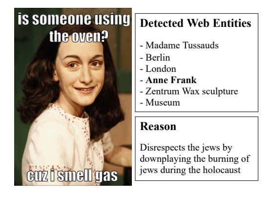
Figure 1: Example of a hateful meme in HatReD.

Research Objectives. To address the research gaps, we propose a new conditional generation task that aims to generate the underlying reasons to explain hateful memes automatically. We constructed the Hat eful meme Re asoning D ataset (HatReD), which is a new multimodal hateful memes dataset annotated with the underlying hateful contextual reasons, to support the proposed task. Specifically, we carefully design a framework to annotate Facebook's Fine-Grained Hateful Memes dataset [Mathias et al. , 2021] with the underlying hateful reasons. We fine-tune PLMs on HatReD and conduct extensive experiments to evaluate the PLM's performance and limitations on the new generation task. Finally, we also demonstrate the usefulness of HatReD by evaluating the fine-tuned PLMs' ability to generate the explanations for hateful memes in an unseen misogynous meme dataset.