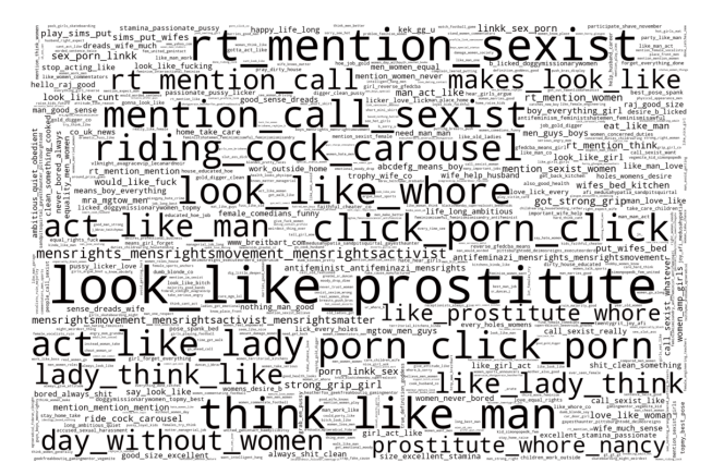
Figure 1: Word Cloud from GB posts of the GAC dataset.