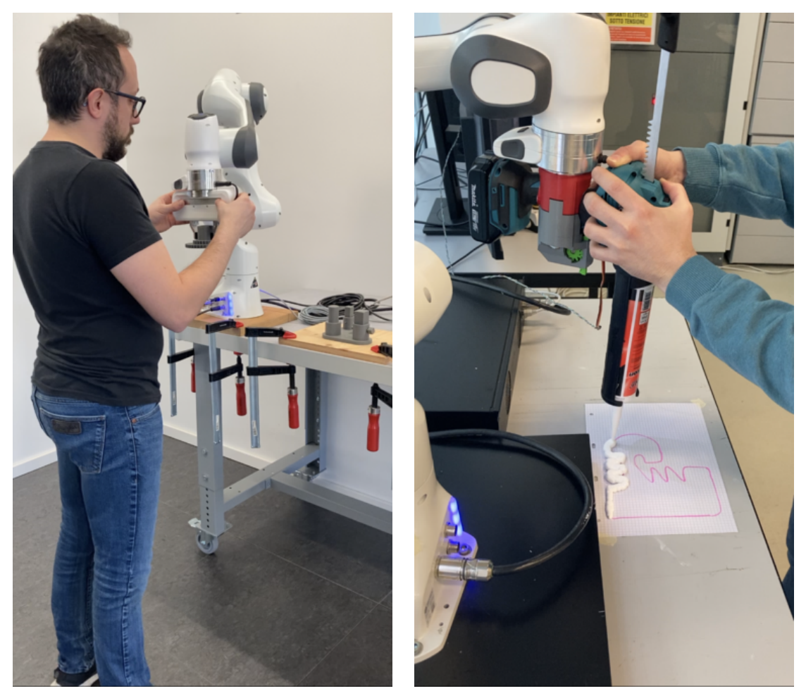
(a) Assembly task