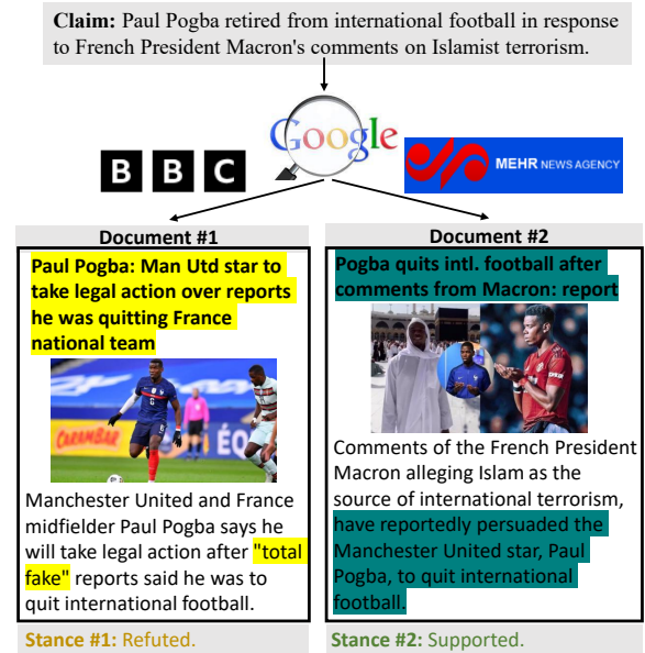
Figure 1: The retrieved documents from Google to verify the claim. The retrieved documents from different media sources have different stances towards the claim.

For example, consider the claim: “ Paul Pogba retired from international football in response to French President